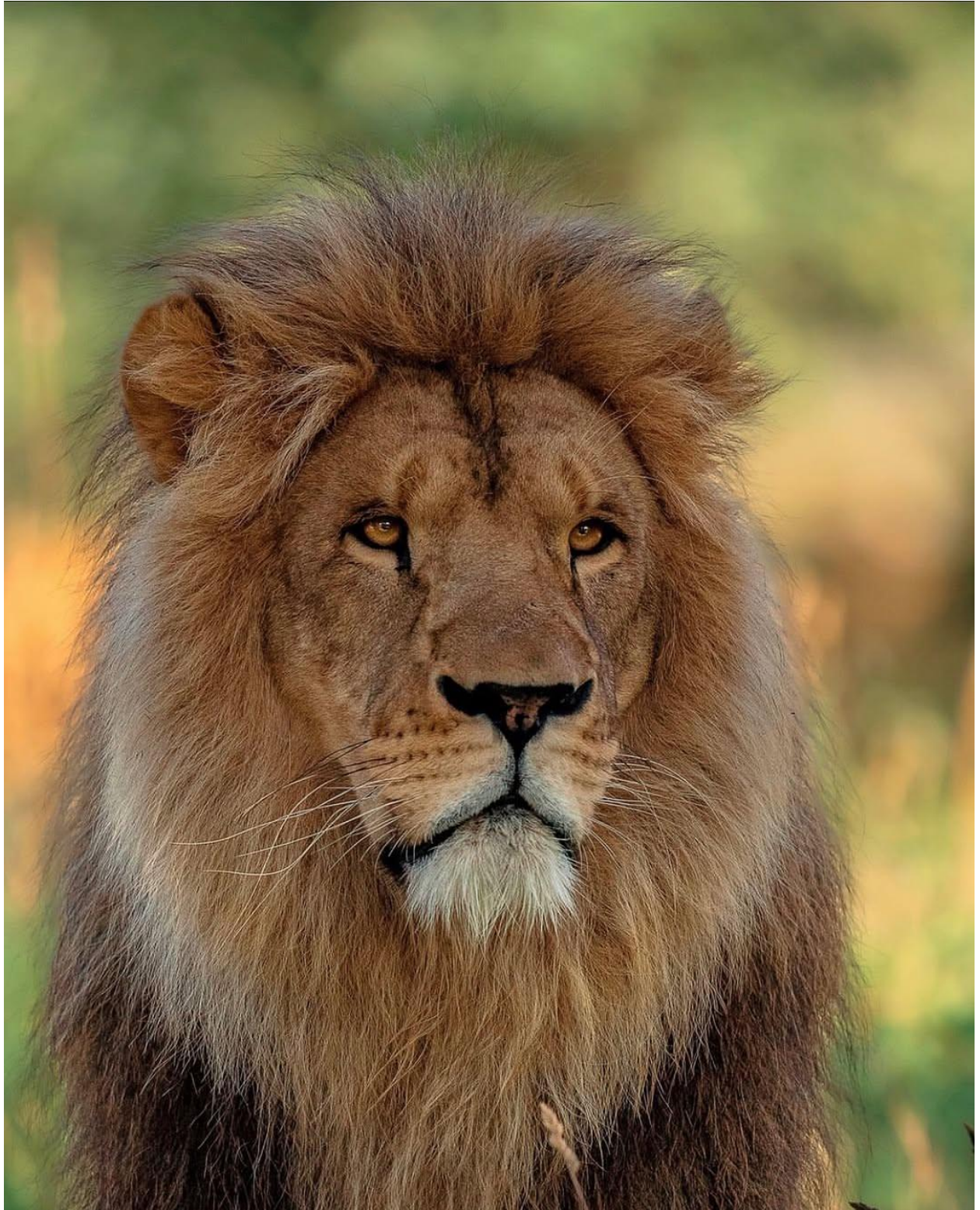
Diversity of Travelers